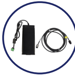
Power supply & valve connecting cable (4.5m) included.