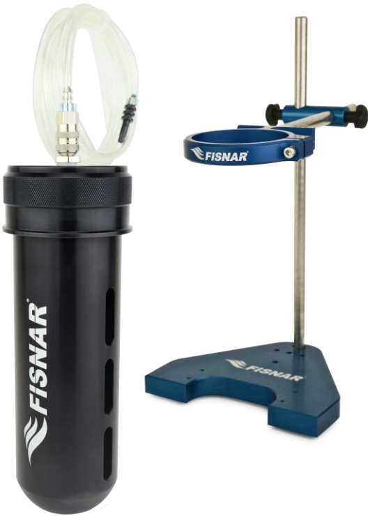
*560534U stand sold separately

The high grade anodized aluminium retainer and cap provide a safe dispensing pressure of up to 100 psi (6.9 bar). The high performance, heavy-duty design also makes this system ideal for use in industrial environments and ensure long lasting use.